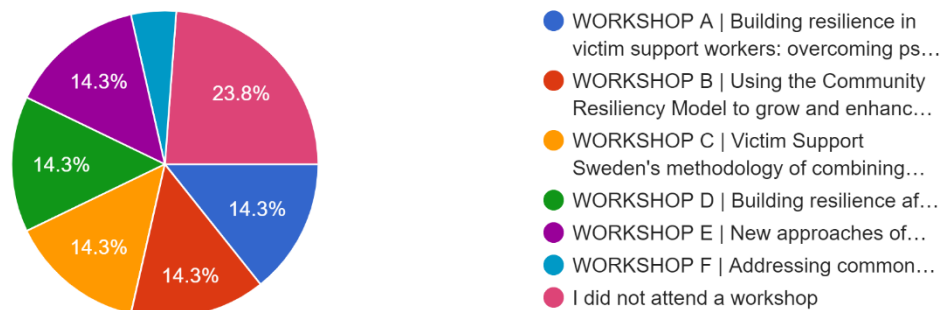
Figure 3: Workshop attendance on Day 1

The workshops on both days were rated positively, with the majority of answers being a 4 or a 5 on a 5-point scale for Day 1 as well as for Day 2. Specifically, on Day 1, participants of various workshops pointed out that they were informative, practical, easy to follow, and had “lively